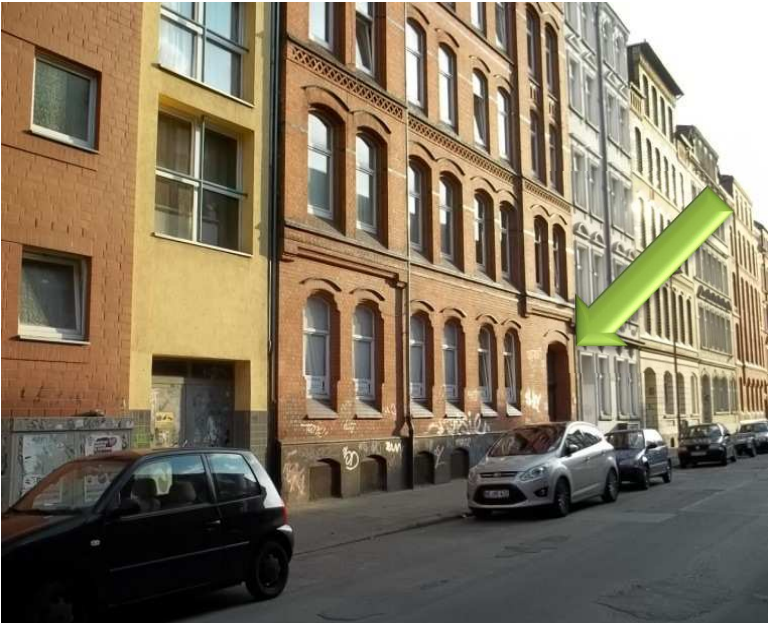
It's house number twelve.